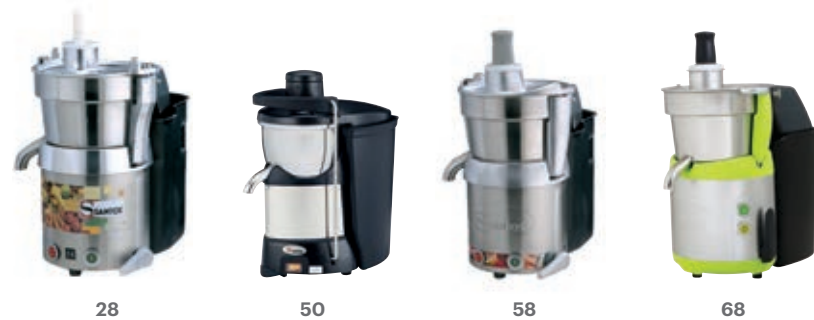
1986 — 2001 — 2006 — 2013 →

Santos has a 30 years' experience in manufacturing commercial juicers and developing exclusive patented systems to provide the best reliability and efficiency.